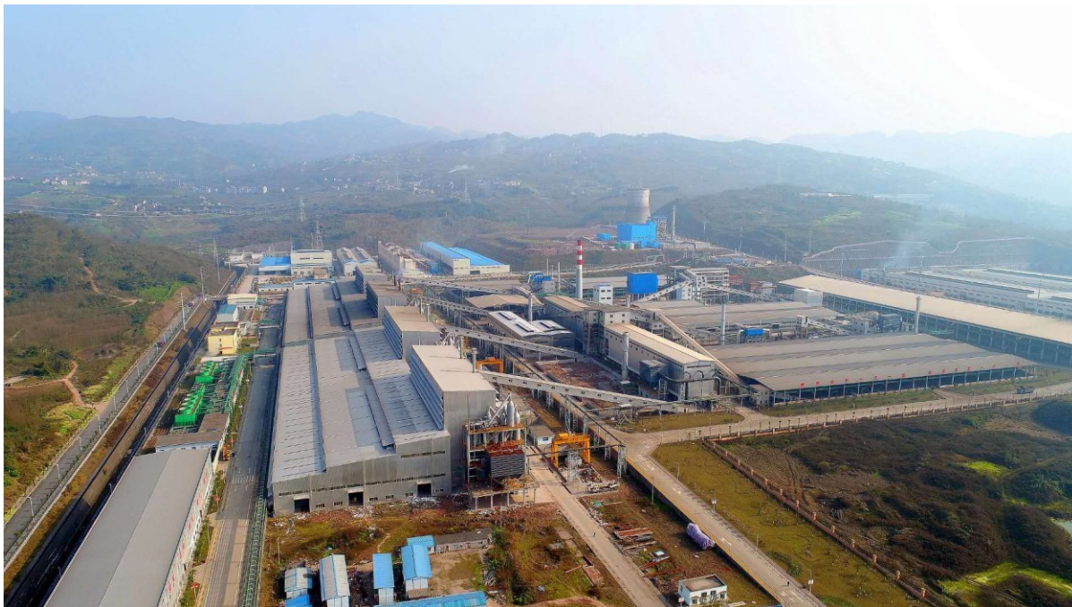
(Sky view of Dalang Silicon Manganese Plant, Chongqing)

From 10:00 to 18:pm, visit Dalang New Material Plant.